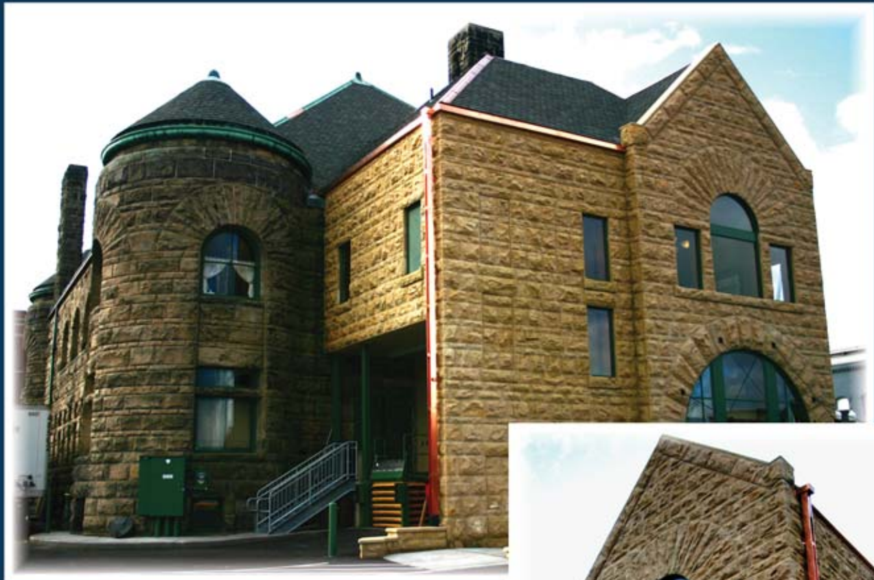
MABEL TAINTER THEATRE - 1889