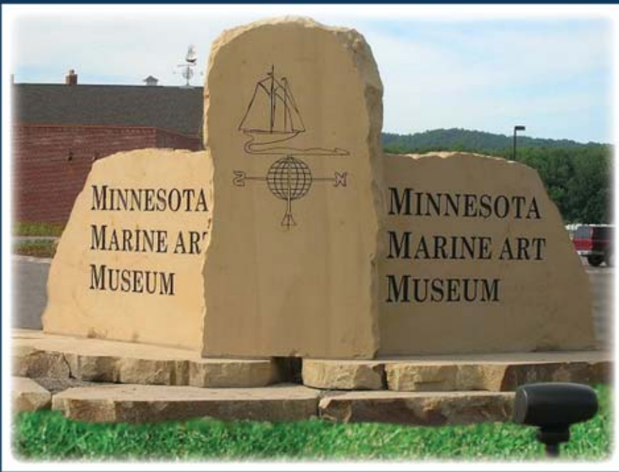
Minnesota Marine Art Museum