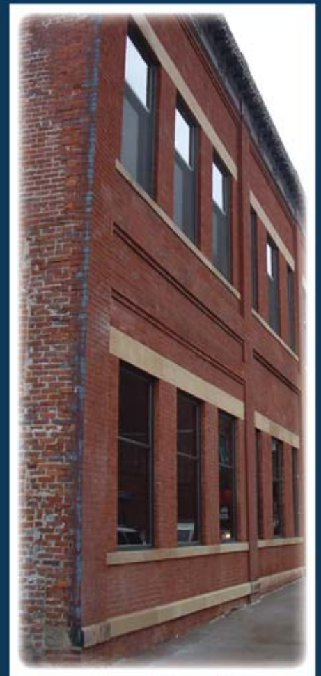
Eau Claire, WI