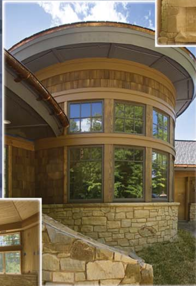
Residential Project in Process Grand Rapids, MN