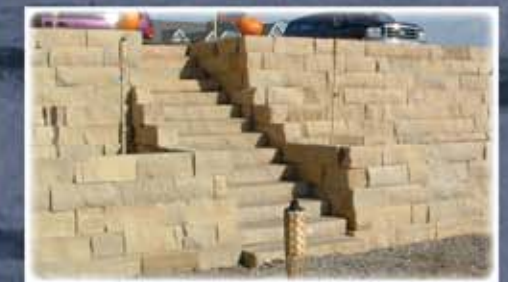
Sawn Retaining Wall & Steps