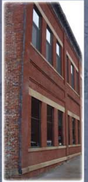
Eau Claire, WI