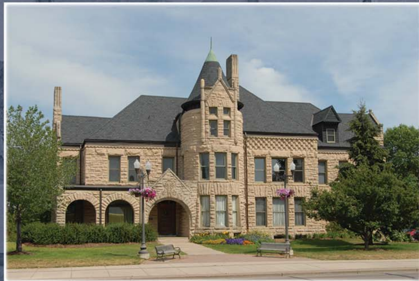
Louis Smith Tainter House - 1890 Menomonie, WI