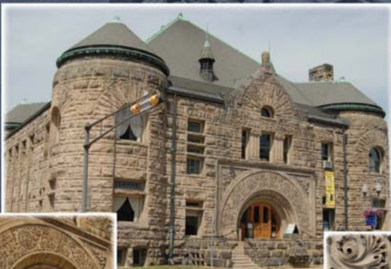
Mabel Tainter Theatre - 1889 Menomonie, WI

Dunnville Sandstone is one of the oldest quarried dimensional stones in Wisconsin, if not in the Midwest. From 1910 to 1913, stone carvers constructing the high altar in the Saint Thomas Church in New York billed Dunnville Sandstone the finest sandstone in the world.