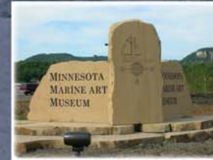
Minnesota Marine Art Museum